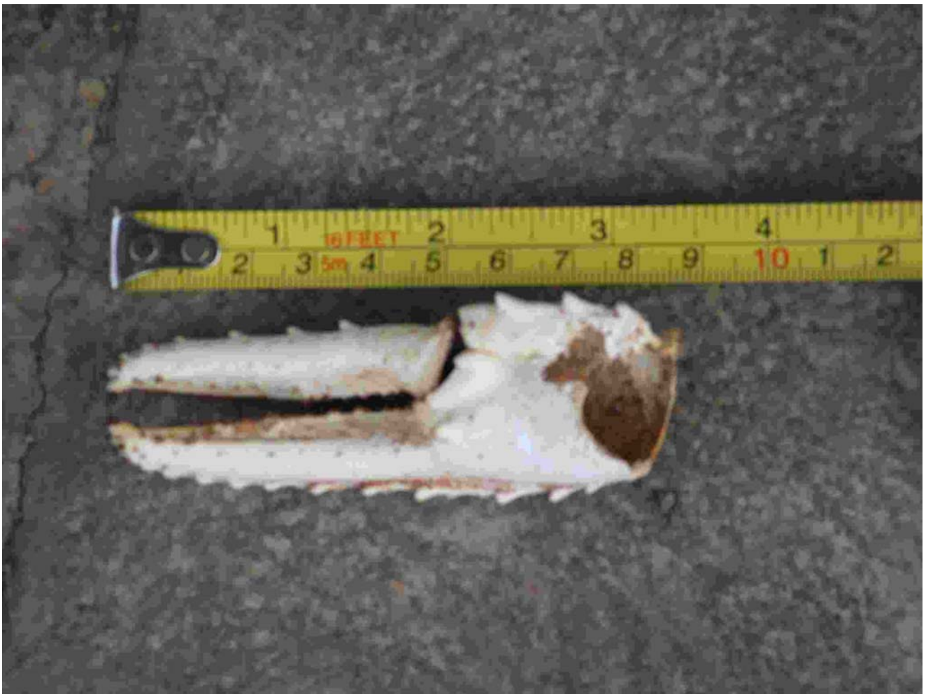
The claw was found on the road near this creek culvert. As you can see there is a lot of erosion on the outlet of this culvert. This dirt is now in the creek.