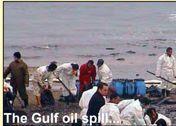
The Gulf oil spill...

thousands of lost lives... blood for oil.