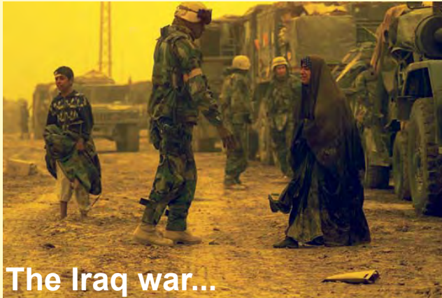
The Iraq war...

thousands of lost lives... blood for oil.