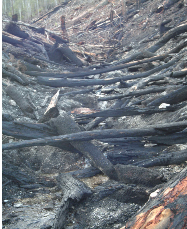
Dazzler Ranges 2004. Cable harvested coupe, the Forest Practices Plan stated that Skyline harvesting should be used with full lift required so that riparian vegetation would not be destroyed.

Sustainability is not defined in the Forest Practices Act or Code. The Board takes the approach that operations are environmentally sustainable, when on the balance of probability, regional environmental values are not significantly affected or destroyed in the longer term. Therefore off-coupe management is as significant as in-coupe operations, hence the application of wildlife habitat strips, dispersed harvesting and other reserves.