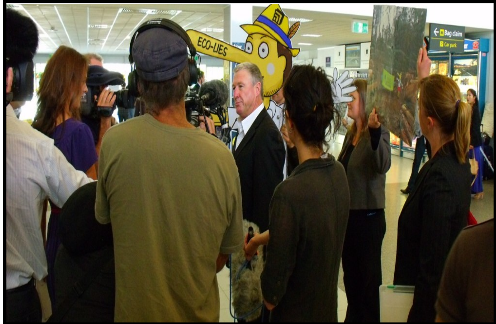
He said: 'timber customers expressed concern about environmental campaigns but he assured them that the forest peace agreement would resolve the unrest' – ABC.