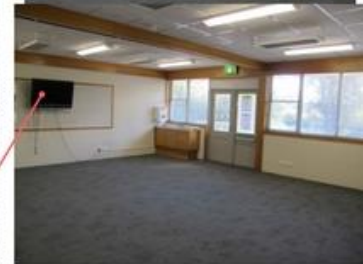
Above is our training room below is the main office space