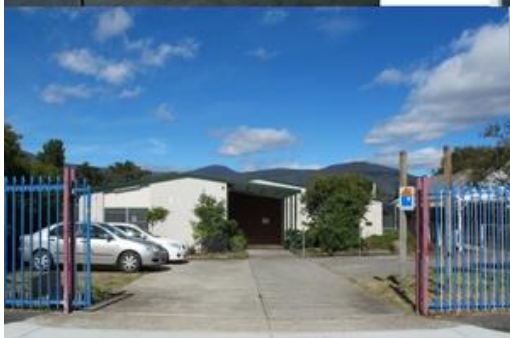
Entrance (above) Front of building & car park (left/right)