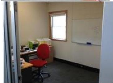
NHT Office space