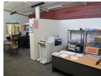
Below is a four office separate space we intend to rent out