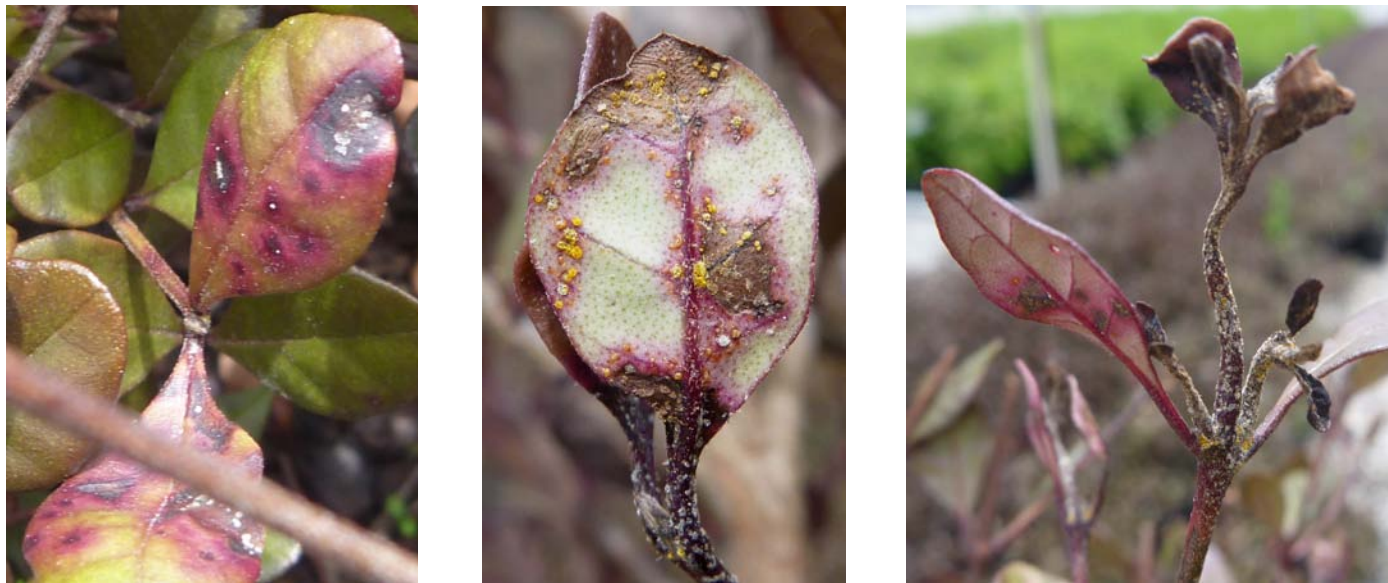
Myrtle rust symptoms on Lophomyrtus x ralphii : right, Little Star; others, Black Stallion.

If you think you have found myrtle rust, contact DPI on 1800 084 881 or email electronic photos of the suspect material to plant.protection@dpi.vic.gov.au , together with a contact phone number.