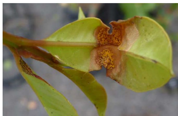
Symptoms of myrtle rust on lilly pillys: top left Acmena smithii ; others Syzygium australe .

For more information on myrtle rust, visit the DPI website www.dpi.vic.gov.au/myrtlerust