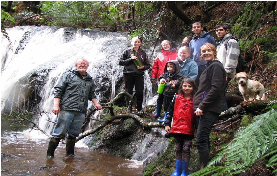
Image 1. Broxhams Falls, 3 generations of Broxhams forest.

This forest has been used by over 3 generations as a place for horse riding, bushwalking, bike riding and showing our visitors the beauty of the Tasmanian bush (Image 1). The coupe is literally 5 minutes walk from my house and borders the property of our neighbours. This is not an isolated forest out the back of town, this is the fabric of a vibrant, connected community and is an integral part of the people that live here.