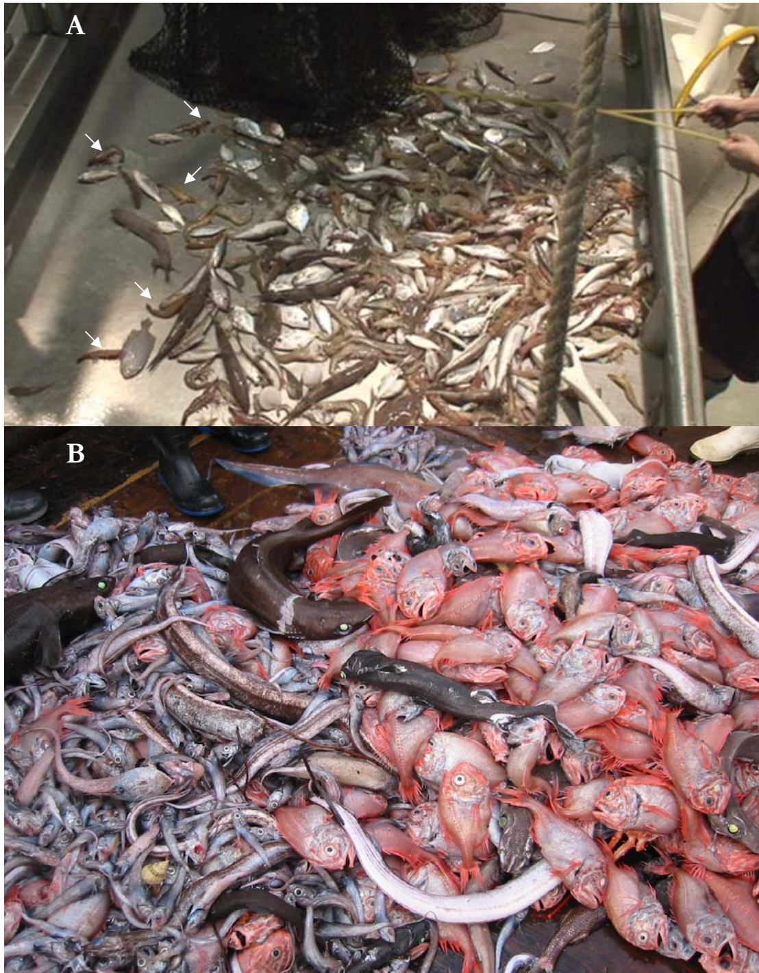
Fig. 3. A. Bycatch from the Northern Prawn Fishery (NPF), Australia's most lucrative prawn fishery. Bycatch rates have been estimated at up to five kilograms of bycatch species for every kilogram of prawns caught (some arrowed), 97% of NPF bycatch is dumped at sea. Location: off Yorke Island, Gulf of Carpentaria, 2006. B. Bycatch taken in a research trawl on orange roughy (reddish fish on the right). Bycatch mortality in this fishery is 100%. Location: onboard the FTV Bluefin off the East Coast of Tasmania, 2006.