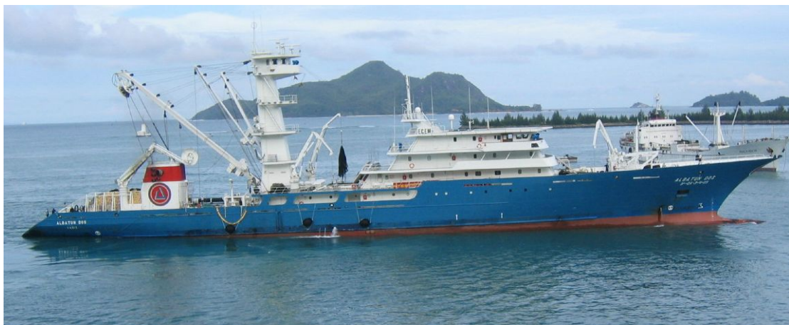
Fig. 2. The Albatun Dos . This 116 metre long, Spanish owned, purse seine vessel can take up to 3,000 tonnes of tuna in a single voyage and is one of the largest vessels of its type; the other two are the Albatun Uno and the Albatun Tres . The ship was built in 2004 with a € 4.9 million (AU$ 6.12 million) taxpayers subsidy from the EU; the subsidies for the other two vessels are unknown (Mulvad and Thurston, 2009).

Environmental threats from pollution, loss of habitat, bycatch, illegal fishing and lost fishing equipment compound the problems. These will be briefly outlined below to give a broader picture of the impact of human activities on the ocean environment and that they also complement, or exacerbate, the effects of overfishing.