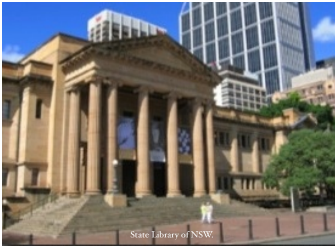
State Library of NSW.