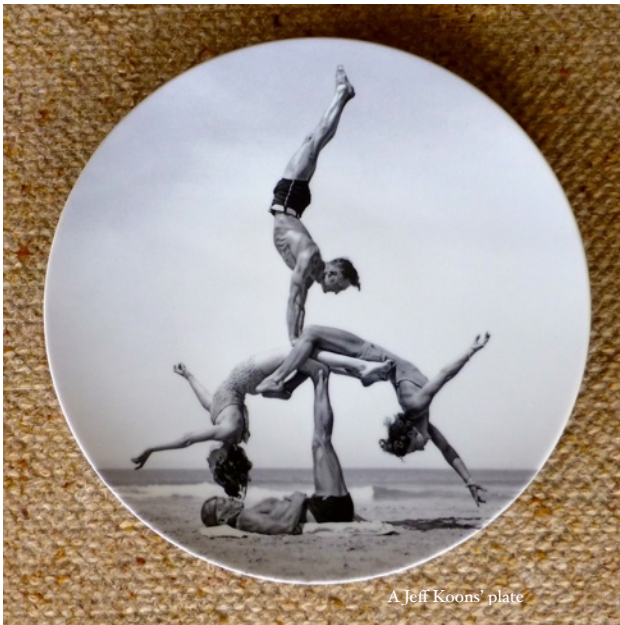
A Jeff Koons' plate

Others to see commercial value are Jeff Koons , with a limited issue of a Plate with a Caddy theme.