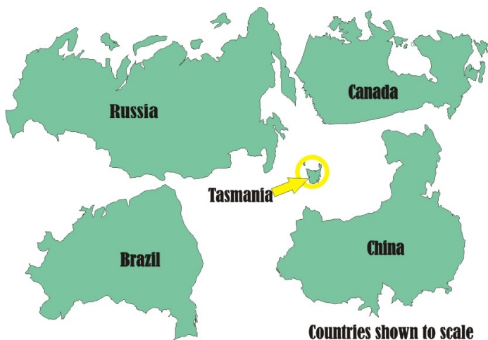
Countries shown to scale

The only way that forestry has been able to maintain any semblance of profitability was via generous subsidies and exemptions from laws coupled with low or no cost resources and other forms of public assistance. Forestry describes their heavily subsidised state as 'sustainable'.